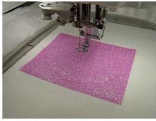
Figure 4—Fusible GlitterFlex Ultra tacked down.