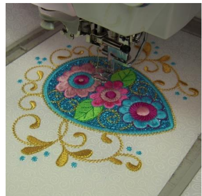
Figure 7—Completed Fusible GlitterFlex Ultra design with super sparkle.