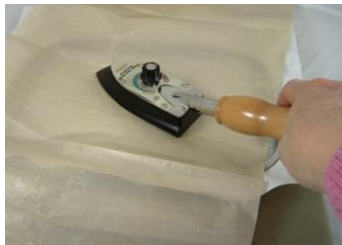
Figure 6—Pressing Fusible GlitterFlex Ultra while in hoop.