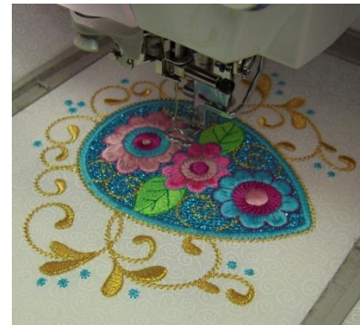
Figure 7—Completed Fusible GlitterFlex Ultra design with super sparkle.