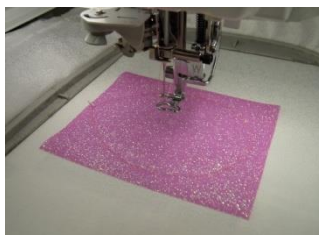
Figure 4—Fusible GlitterFlex Ultra tacked down.