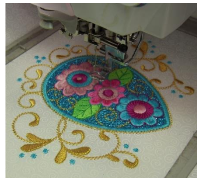
Figure 7—Completed Fusible GlitterFlex Ultra design with super sparkle.