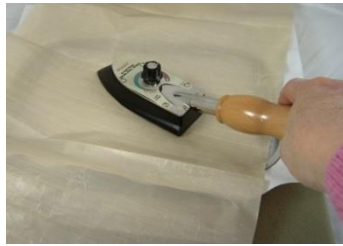
Figure 6—Pressing Fusible GlitterFlex Ultra while in hoop.